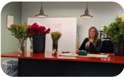
Ability Adventures Floral Arranging

262-349-4946 or email: info@aduldaysewi.com