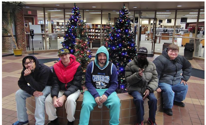
Wisconsin Center Bookworms love the library!