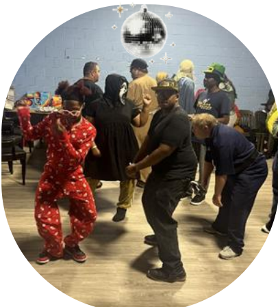
Wisconsin Center Halloween Dance